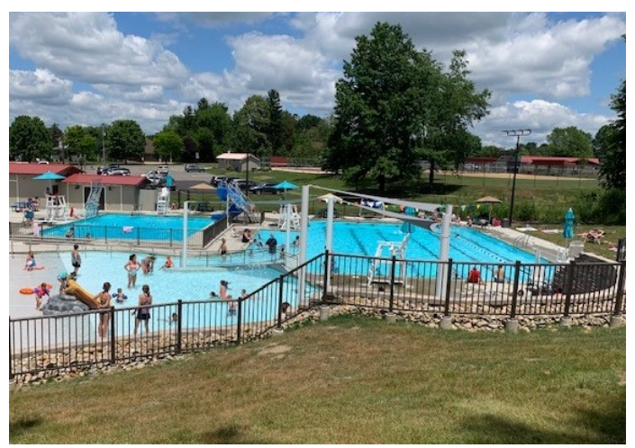
The Zelienople Community Pool is now open to members and residents from the Zelienople, Harmony, Jackson, and Lancaster communities only. Proof of residency is required.

The Community Park Board would like to thank all of its residents and the surrounding communities as we adapt to the ever changing directives resulting from COVID-19.